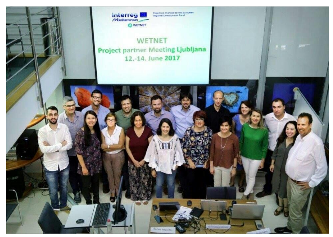
Wetnet Steering Committee meeting in Ljubljana (12-14 June 2017)