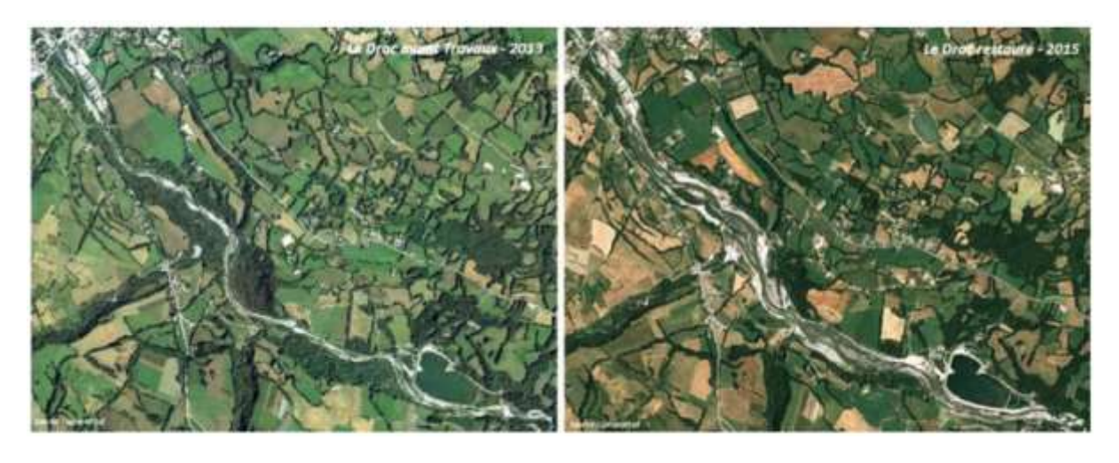
Figure 4. On the left panel, aerial view on the single channel Drac prior the 2013 intervention; the Champsaur dam can be recognized in the bottom right corner. The river flows towards the top of the picture. On the right panel, the same reach after the intervention.