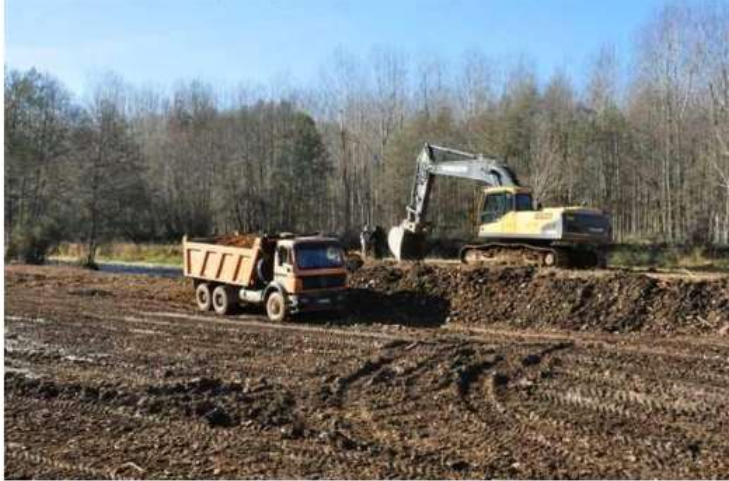
Figure 7. An artificial levee is lowered to recover lateral connectivity.

active public participation process was set in place, involving stakeholders in 50 meetings during 3 years and including environmental river restoration volunteering by NGOs, eventually facilitating a successful implementation.