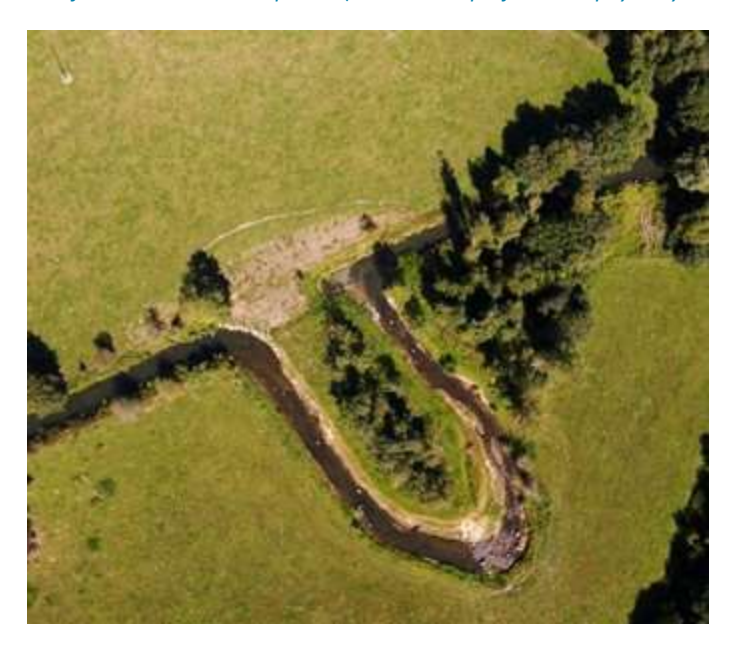
Figure 2. Re-meandering of the Eau Blanche at Boussu-en-Fagne.