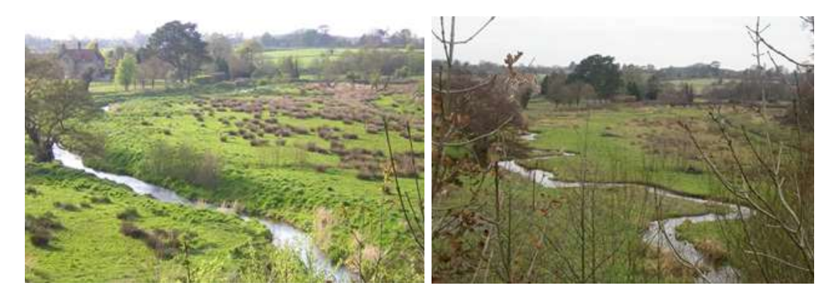
Figure 13. Re-meandered reach of the River Glaven at Hunworth: (a) In January 2009, prior to the rehabilitation project, on the left, and in December 2010, after re-creation of meanders in August on the right.

The restoration work had a moderate but detectable effect on flood peak attenuation, owing to the limited length of restoration (Clilverd et al., 2016), and improved free drainage into the river. A coupled hydrological/hydraulic model was utilised to analyse the impact of the floodplain reconnection before and after restoration. Using data from 2007 to 2010, the study found that the removal of the embankment resulted in widespread inundation of the floodplain at high-level flows (>1.7m<sup>3</sup>s<sup>-1</sup>). Restoration also promoted regular inundation of the immediate riparian area during lower magnitude flood extents. In addition, groundwater levels were slightly higher and subsurface storage was greater.