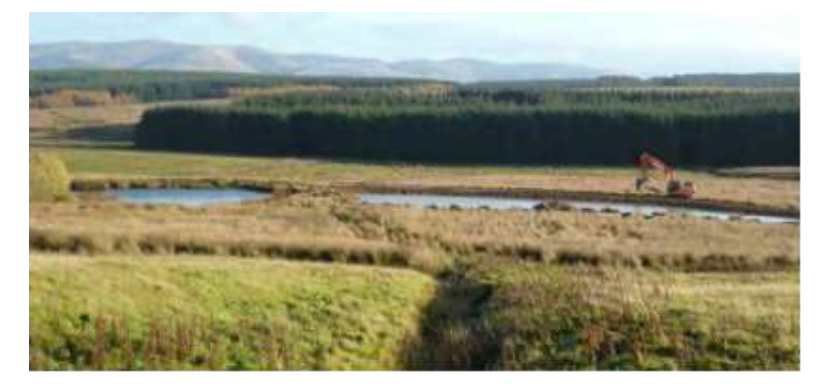
Figure 11. Construction of new ponds in the upper catchment.

Despite still being at a relatively early stage, the project has shown an improvement in river ecology and it is on track to restore the river from Bad to Good Ecological Status. Further significant progress relies on landowners being willing to change current land use and management practices. As regards the monitoring activities, salmonid surveys were carried out before the project began and a new set of surveys will be conducted in the near future to determine the effect the works have had on fish populations. Surveys in 2014 to 2016 showed the presence of salmon redds and Eurasian otter ( Lutra lutra ) in the remeandered river reaches. Although a quantified account of ecological improvement on the Eddleston Water will require further work, it is clear from site visits that the new habitats created are being occupied by salmonids. Moreover, preliminary results show that different NFM measures can reduce flood risk through both temporarily storing surface waters and delaying the flood peaks, as well as through increased surface roughness and groundwater connectivity.