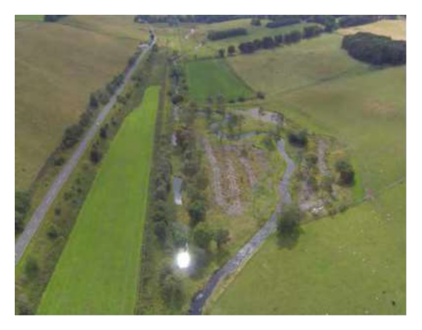
Figure 12. Re-meandered section of Lake Wood, with the old channel on the left.

This project provides evidence that the restoration of the catchment can be undertaken alongside the continuation of sustainable farming and livelihoods and that the public participation is crucial to reach the objectives. Moreover, the NFM integrated measures to reduce flood risk and habitat enhancement measures to improve ecological condition provide a wide range of additional benefits and ecosystem services. Lastly, surveys of a flagship species, such as the Eurasian otter ( Lutra lutra ), were carried out beside to the monitoring of fish populations.