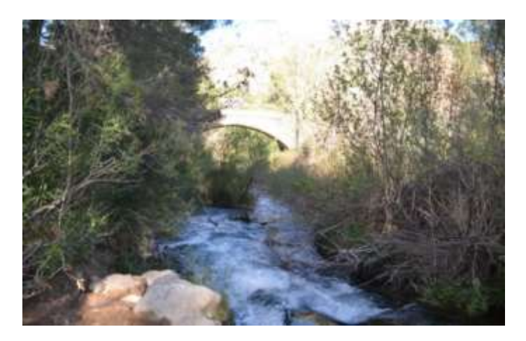
Figure 10. Restored flow along the Turia River.

The most innovative aspect of this restoration project is the establishment of environmental flows, a kind of restoration measure that have been shown to be important to the ecological and geomorphological dynamics of regulated rivers, with significant implications in terms of environmental services provided (Davies et al., 2014). The establishment of environmental flows can also be considered as a measure of improved river governance.