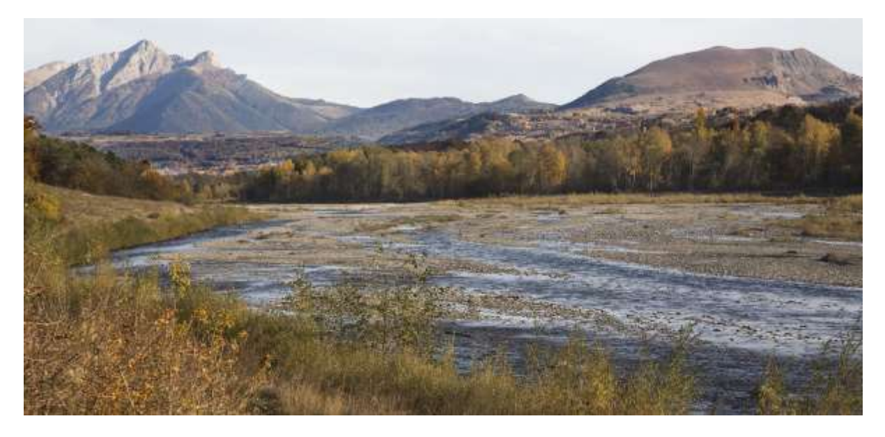
Figure 3. The Drac in the restored reach (October 2017).