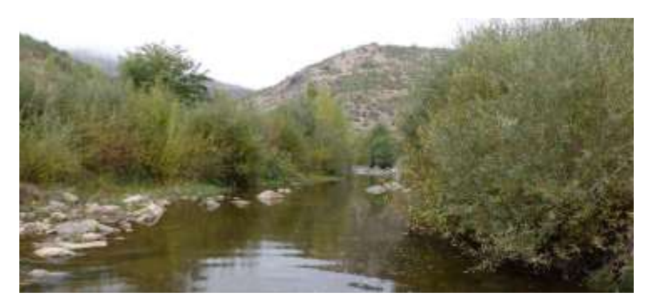
Figure 6. Riparian vegetation inside the old reservoir in 2018.