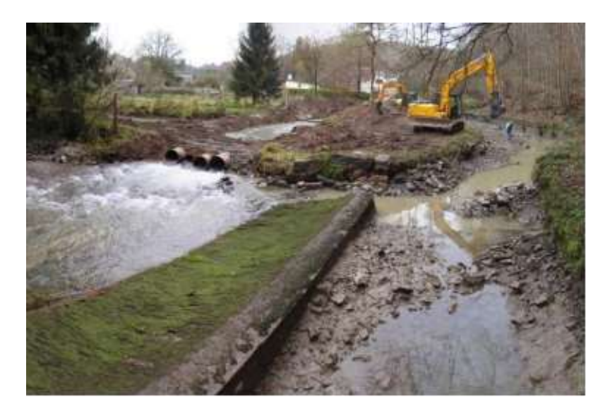
Figure 1. Works for weir removal at Spontin (source: LIFE project «Walphy» Layman's report).