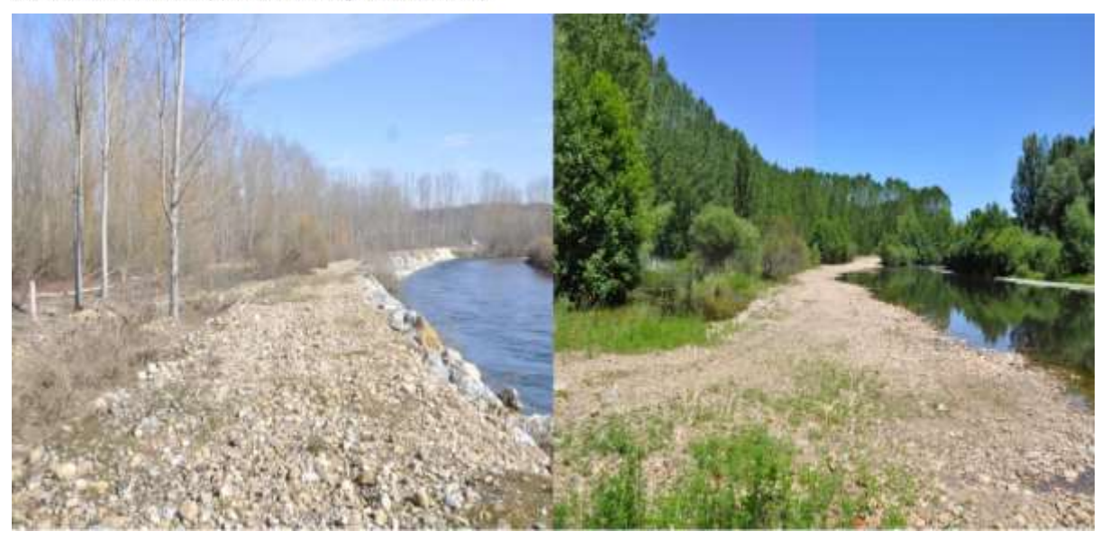
Figure 8. River bank protections were also removed along the river: on the left, the situation before the project; on the right, the river is reconnected to its floodplain.