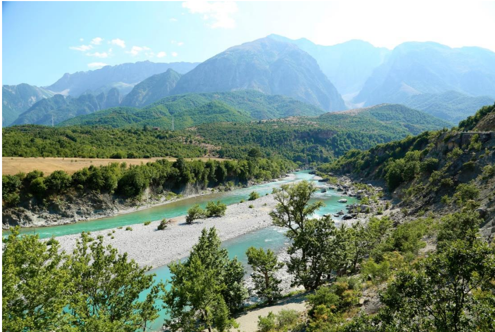
The Balkan Rivers: living, threatened, unknown. Europe's secret natural heritage. Above, the Vjosa in Albania.

The tour is co-organized by EuroNatur, Riverwatch, Leeway Collective and WWF Adria and supported by Patagonia, Manfred-Hermsen-Stiftung and Mava Foundation.