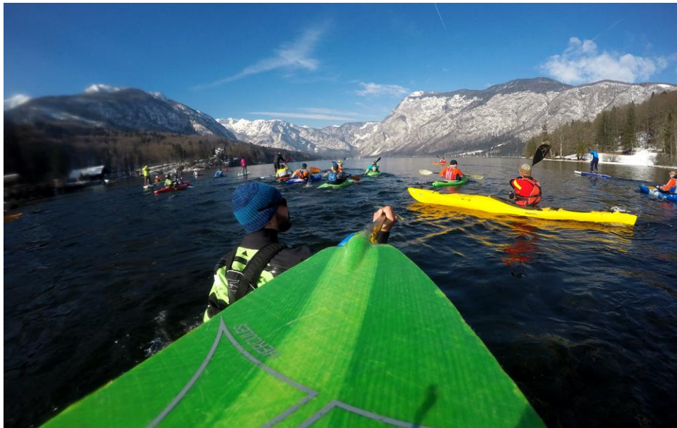
Kayakers from all over Europe will paddle 16 of the most beautiful and threatened Balkan rivers between 16.4.-20.5.

The image most people have of the Balkans is related to beaches, post wars and nowadays to the refugee crisis. However, there is a completely different aspect to this area, which is still widely unknown: its rivers. The most valuable rivers of Europe can be found between Slovenia and Albania. Crystal clear streams, wild rivers with extensive gravel banks, spectacular waterfalls and huge alluvial forests – rivers full of wildlife. The Blue Heart of Europe beats on the Balkan Peninsula!